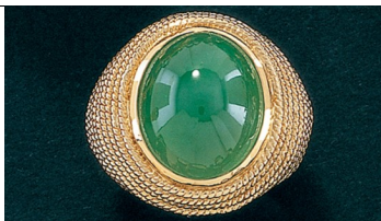
Jadeite jade, often cut as a cabochon, is one of the most valuable and culturally significant gemstones.